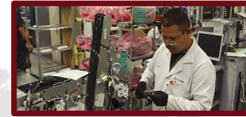
REVERSE & REPAIR