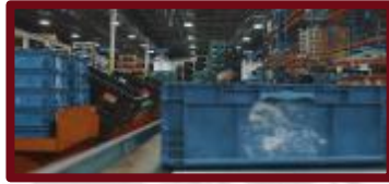
INBOUND TO MANUFACTURING