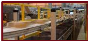
INBOUND TO MANUFACTURING